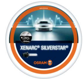
Mouse Pad (401D214XX)