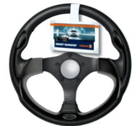
Steering wheel tag (401D215XX)